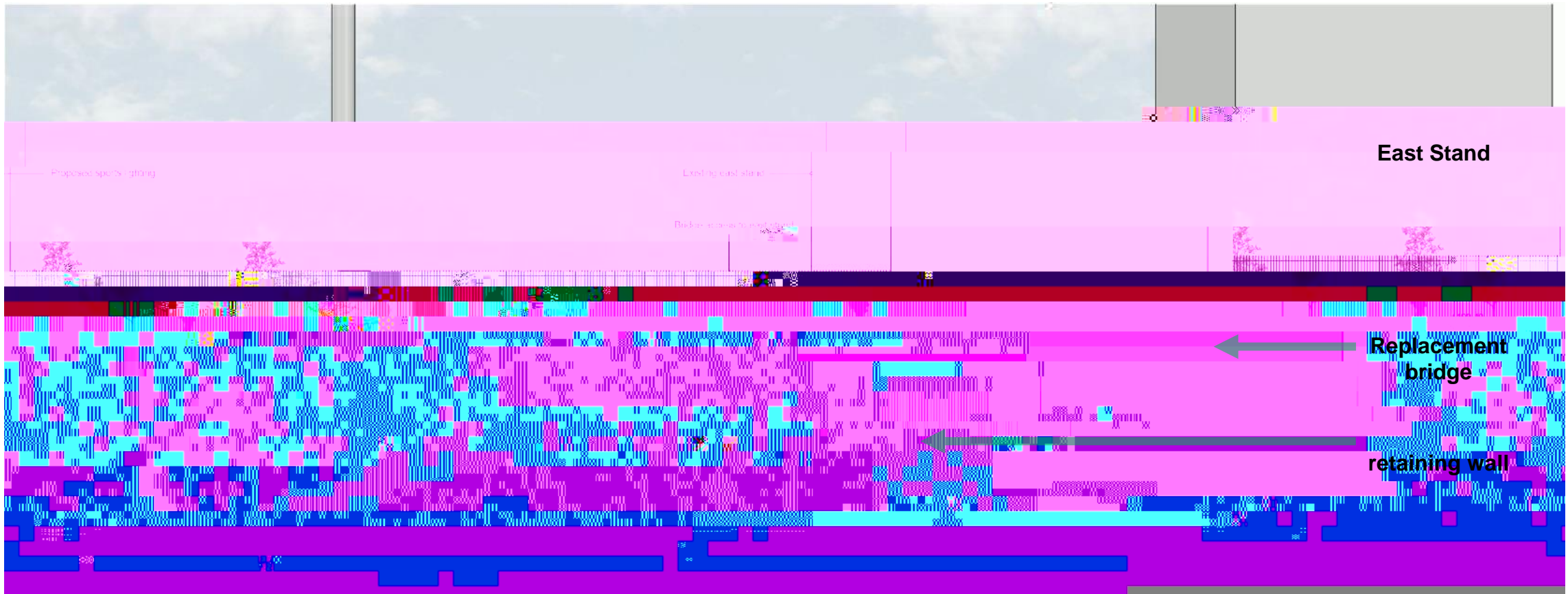
An image showing the replacement bridge and updated design of the East Stand South Retaining Wall

A replacement bridge between the East Stand and Southern Concourse, and changes to the design of the East Stand South Retaining Wall are required. These changes will resolve a structural issue associated with the bridge, and improve the appearance of the retaining wall. The updated design adds a 'step' to the retaining wall in order to break up the appearance of the wall, as shown on the image below. The 'step' would be planted with wildflowers to match the surrounding embankment. The updated design would not impact any existing or proposed trees, or other vegetation. Whilst it is not intended that the 'step' in the retaining wall is accessed by members of the public, a safety railing has been added as a precautionary measure.